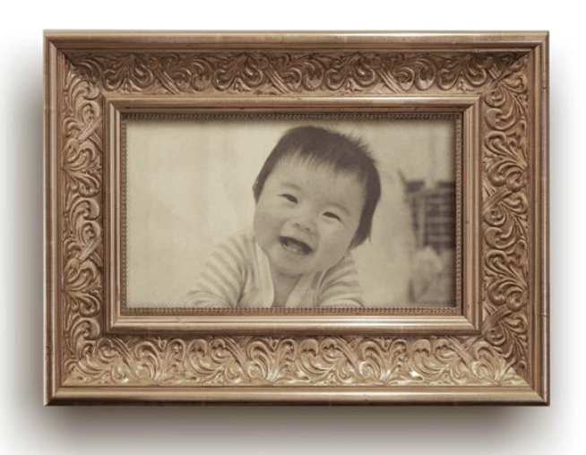
Legacy & Retirement Planning - Etiqa Premier

Etiqa Life International (L) Ltd, an offshore life insurer has recently introduced high net worth insurance products in the market known as Esteem legacy and Esteem eternity .